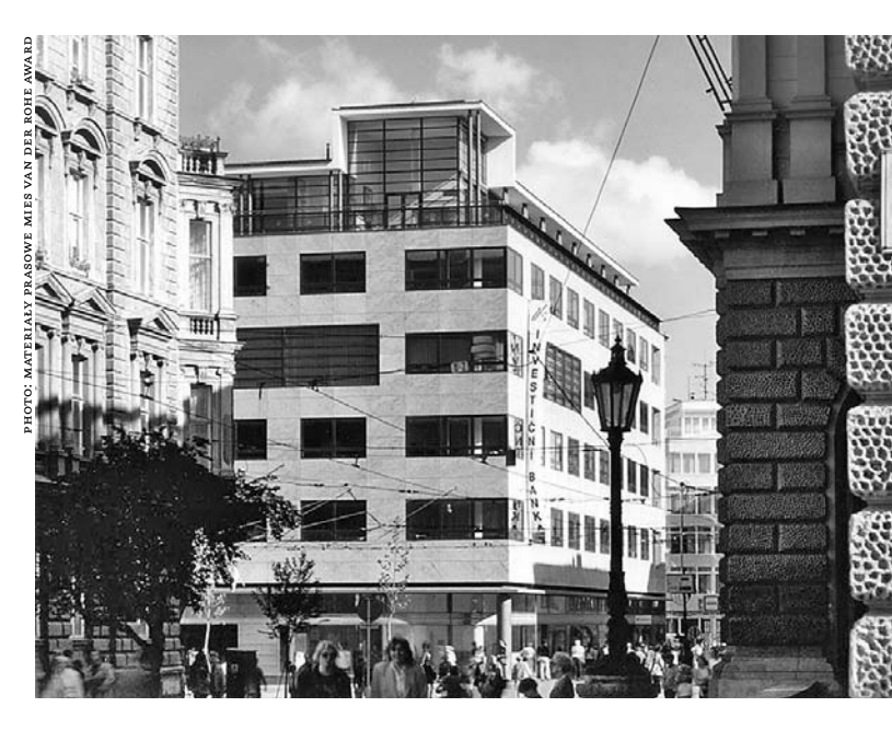
IPB Bank building, designed by Aleš Burian and Gustav Křivinka, 1995

Practically throughout the 1990s in the Czech Republic, building construction developed on a small scale, while the financial turnover on the market and the availability of mature financial products, in particular long-term credit loans, changed very slowly. The scale of investment, and therefore the size of buildings and architectonic complexes, started to increase around the year 2000 due to the growing presence of strong investors. Access to technology and materials also improved. By 2000, the Czech construction industry was essentially meeting all European standards. During the construction of big buildings with strict financial management, complying with norms was more important than the previously cherished skill of improvisation. The anonymous office buildings and massive shopping centres which a few decades earlier had flooded the developed countries of Europe and the USA were created on a mass scale. As Ruedi says, "The built product of modernisation